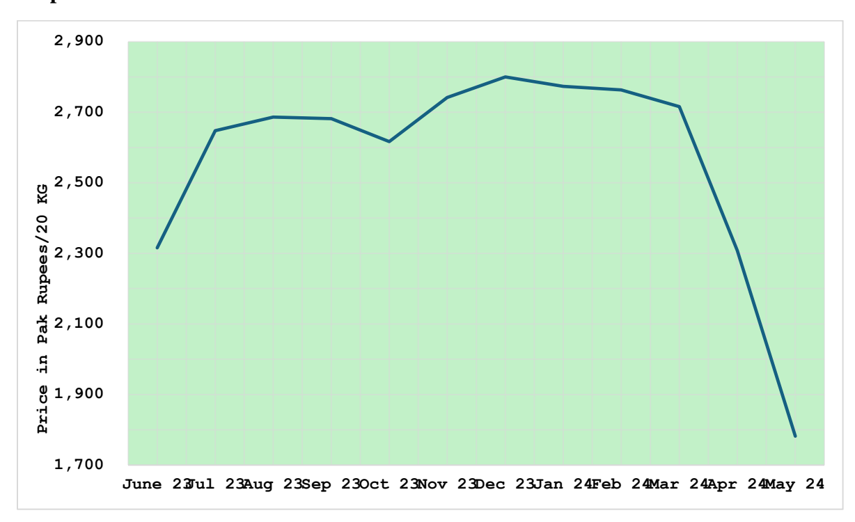
Graph A: Wheat Flour Retail Prices

with the seasonal drop at harvest, the price decline this year was steeper due to the government's decision not to procure wheat.